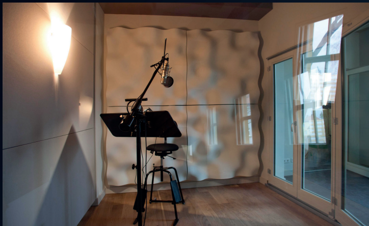
ISO BOOTH B1