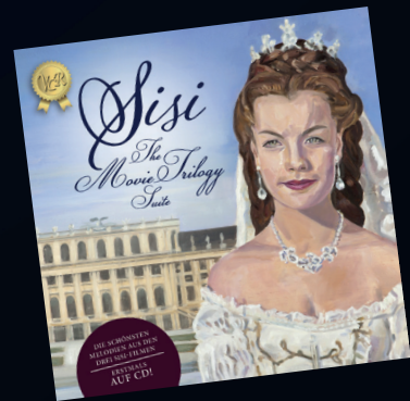
Sisi – The Movie Trilogy Suite