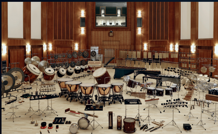
Extensive Collection of Percussion Instruments

Last but not least, classical artists are again attracted by the outstanding acoustics of Synchron Stage Vienna . The Vienna Chamber Orchestra, conducted by Stefan Vladar, chose Stage A for an extensive recording session of all solo concertos by Beethoven, to be released on the classical music record label Capriccio.